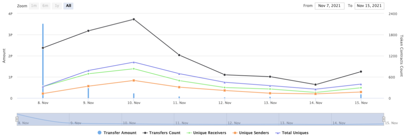
Token Contract 0x4c769928971548eb71a3392eaf66bedc8bef4b80 (HarryPotterObamaSonic10Inu)